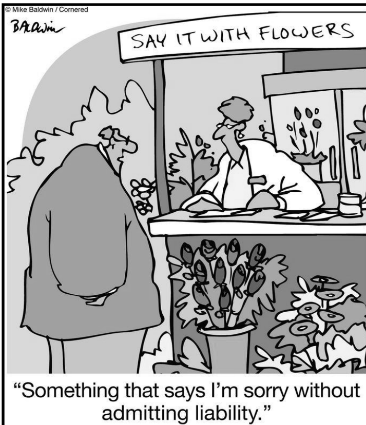
Cartoon Stock - Order #716487

Congratulations! You've won a $50 gift card to your favorite restaurant!