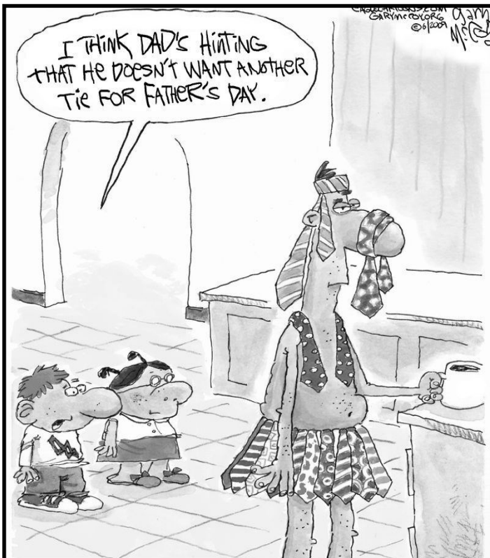
Cartoon Stock - Order #661960

Congratulations! You've won a $50 gift card to