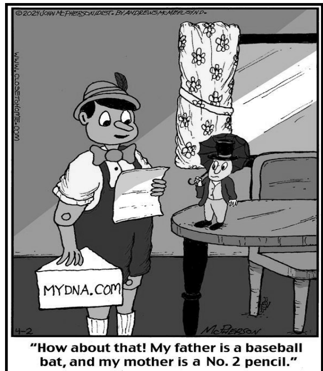
Cartoon Stock - Order #705353