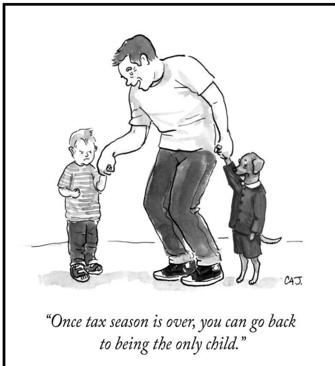
Cartoon Stock - Order #705351

Congratulations! You’ve won a $50 gift card to your favorite restaurant!