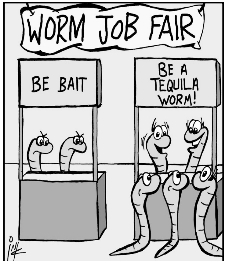
Cartoon Stock - Order #651604