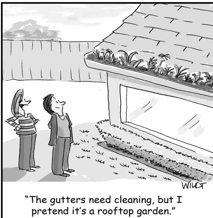
Cartoon Stock - Order #707899

Congratulations! You've won a $50 gift card