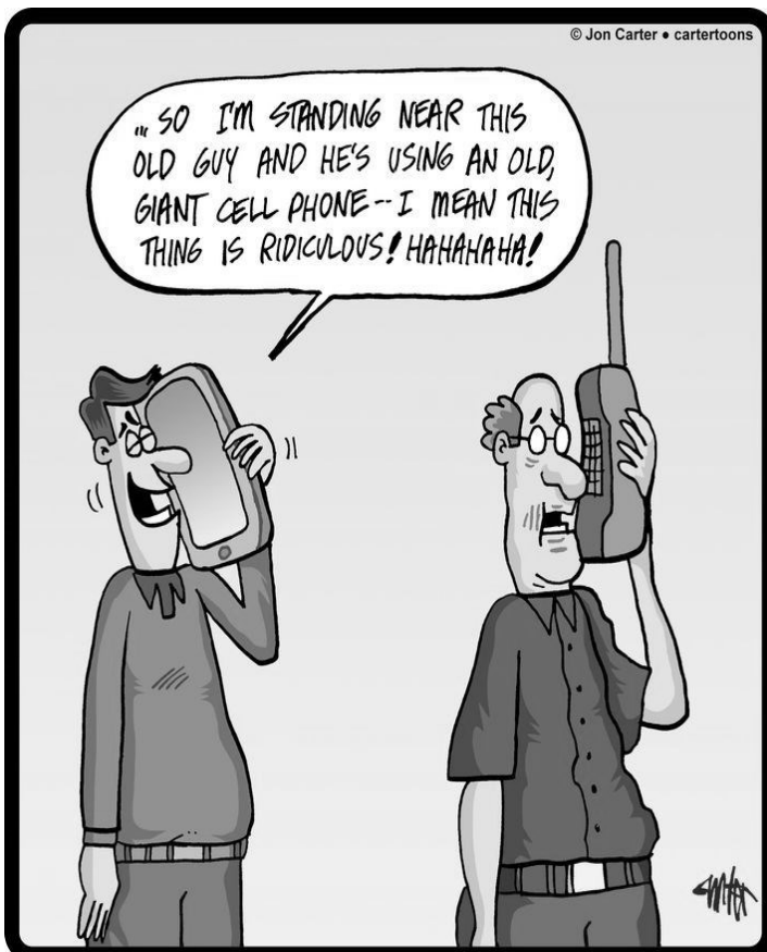
Cartoon Stock - Order #664130

Congratulations! You've won a $50 gift card to