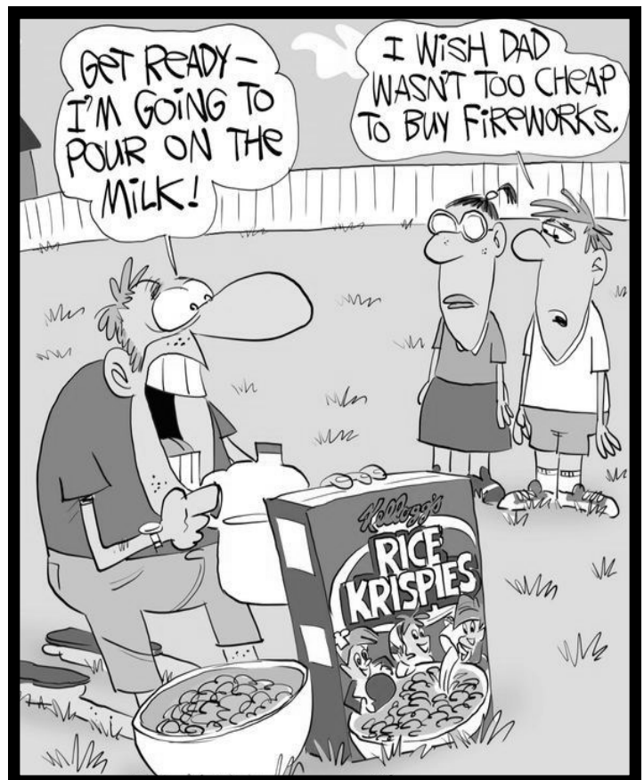
Cartoon Stock - Order #664132